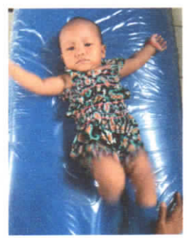
Admitted in LSO Aug. 2016; Six mos. old