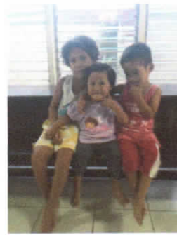
Admitted in LSO July 2016. They are 9, 2 and 4 years old.