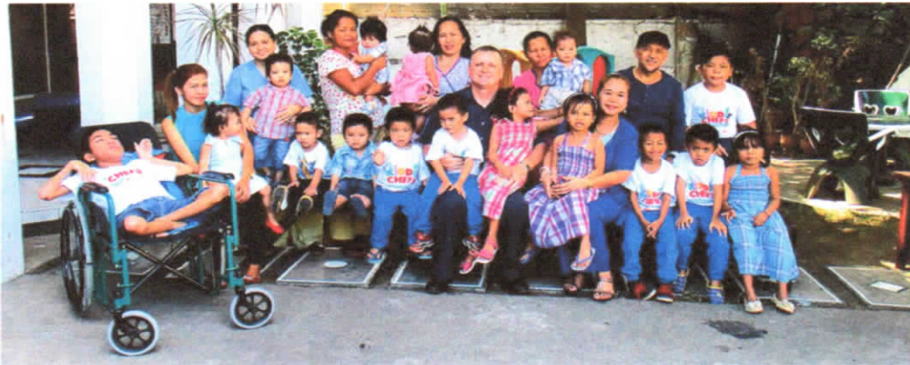
Living Stones Orphanage children, staff and directors.