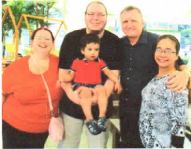
We praise God that this two-year old boy was adopted by a couple from Belgium in July!