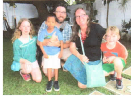
Also in July, Dodong (5) was picked up by his new family from Australia! Praise the Lord!